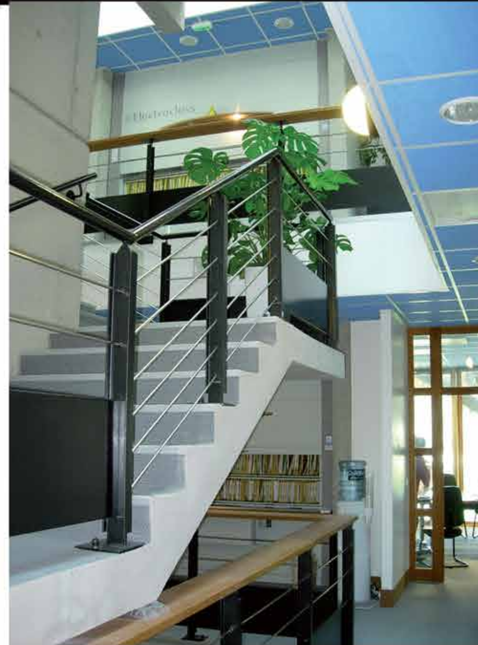
GYROCLASS Vertical Carousel GYROCLASS Vertical Carousel

Wooden tables and overhead lighting are standard as well as lockable bay doors, and keyboard in the table. Standard colours are light and medium grey, but a complete range of RAL colours is possible.